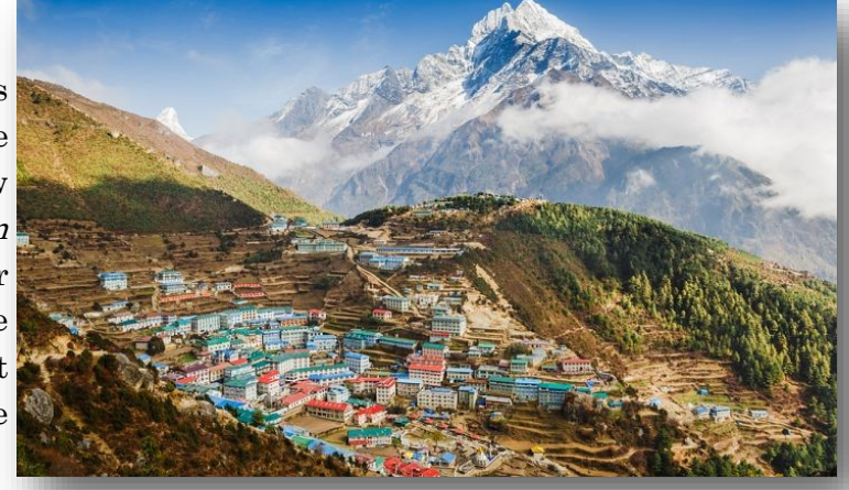
View of the Himilayas in Nepal.

Like so many others around the world, the people of Nepal know of the American Dream . She applied for a student visa to the U.S. and was the first in her class to acquire a U.S. student visa.