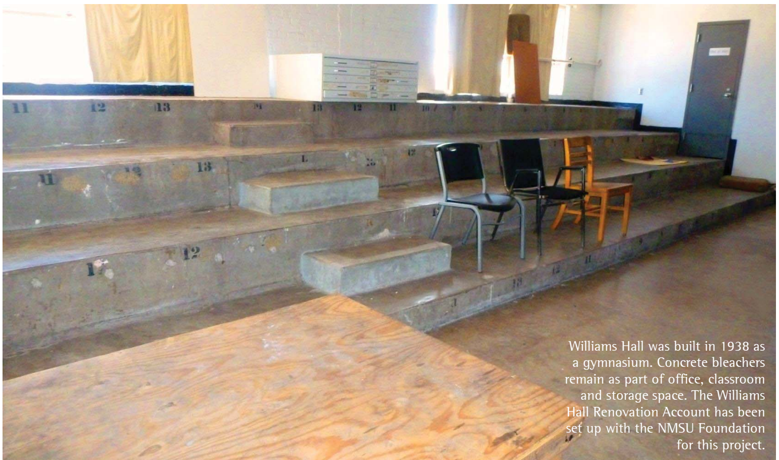
Williams Hall was built in 1938 as a gymnasium. Concrete bleachers remain as part of office, classroom and storage space. The Williams Hall Renovation Account has been set up with the NMSU Foundation for this project.