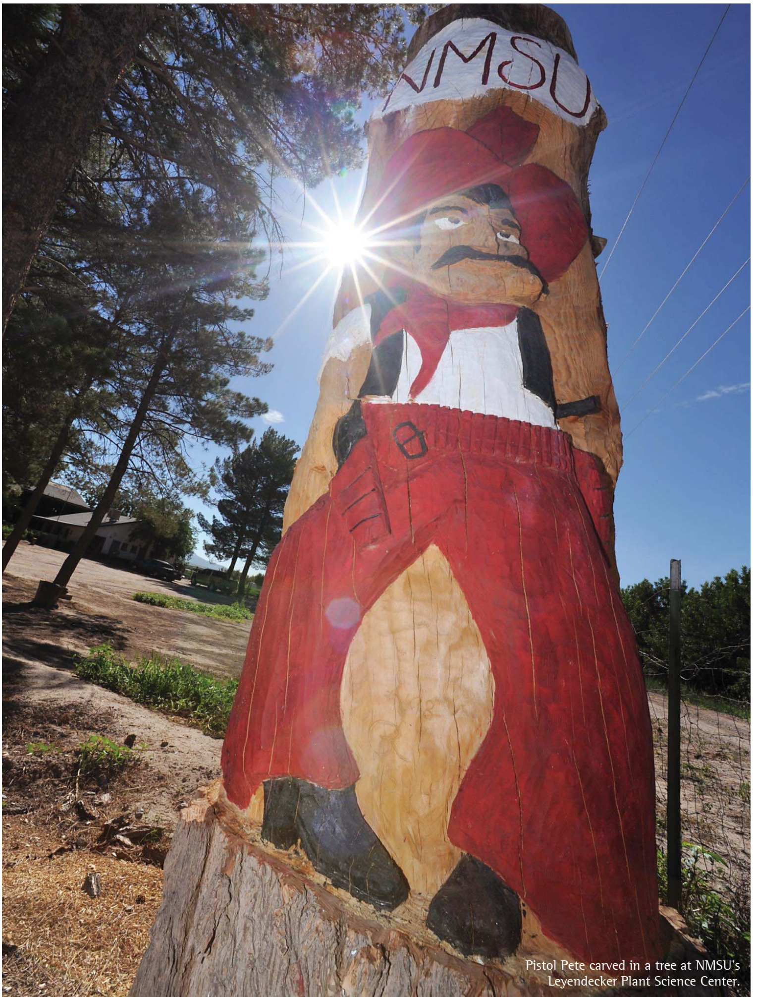
Pistol Pete carved in a tree at NMSU's Leyendecker Plant Science Center.